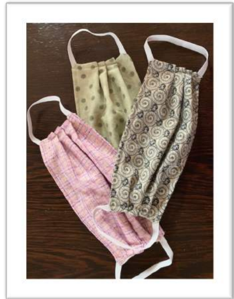
Masks sewn by Betty.

Sew anyone? I have been doing what everyone else is doing - watching the depressing news, or movies, or reading. Then today I saw a suggestion on TV to make your own surgical masks at home, so I looked it up and it is easier than pie. I had to find the elastic at JoAnn's (they only have 3/8" instead of 1/4" but that works too) and I have plenty of material to use up in my stash. After the material is cut (7x9" for mine) you sew the two layer together with the elastic, turn it right side out and then over sew all the seams with tucks in the sides - look it up, there is a video to watch. There is likely going to be a shortage for health care workers and these can be washed and used again. Check it out. Betty Barna