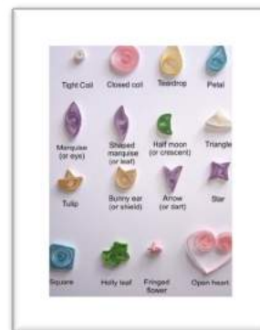
Paper quilling shapes and sample courtesy of Pinterest.