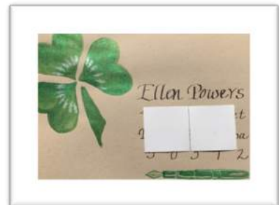
My Pushing the Envelope Creations. I sign up for cards as well.