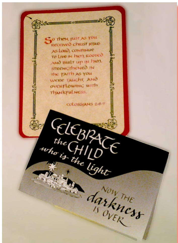
Top, variegated red ink in uncial - Below, white ink on black paper and vice versa -Sharon Schmidt