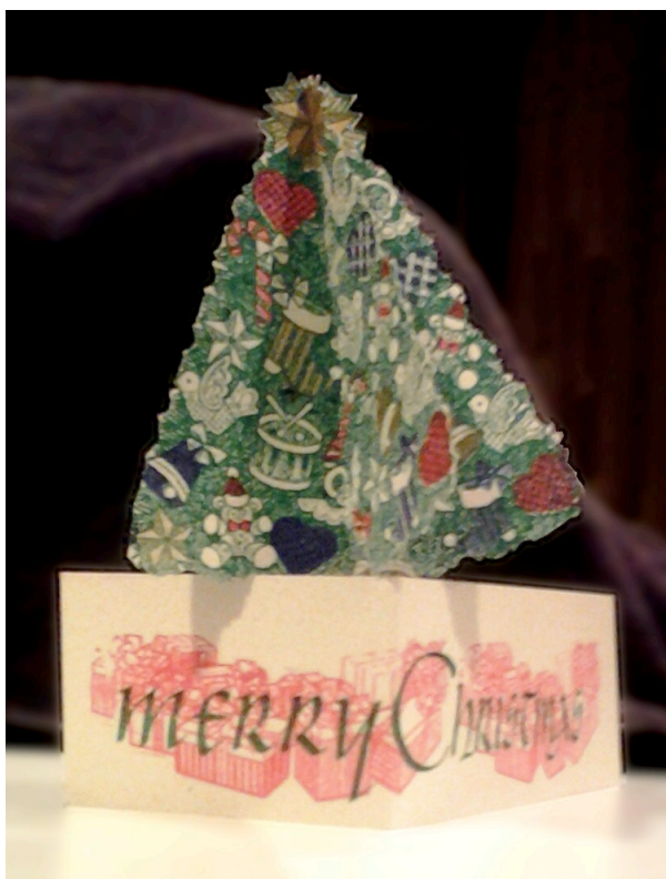
Gocco art, hand cut, trees interlock, compressed uncial letters -Sharon Schmidt