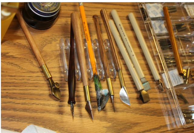
Some of Tom's pen assortment.