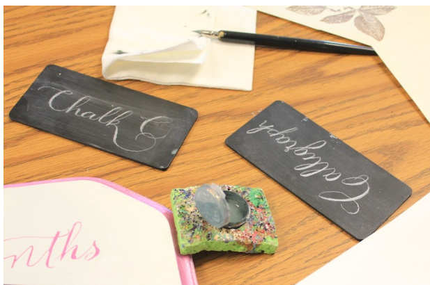
Nicole's lettering on various surface textures.