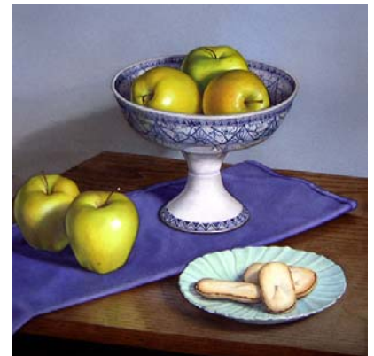
Yellow Apples watercolor on paper 13 by 13 inches

Fee: $375.00--part of this amount goes to supplies provided to participants, including an 8404 #6 Raphael WC brush