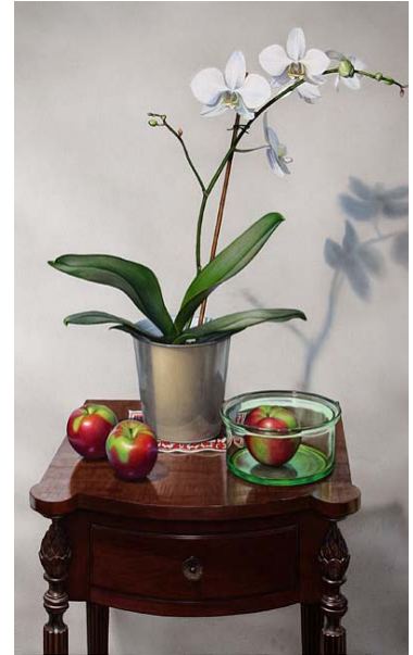
Orchids and Apples, 2004 watercolor, 30 x 20"