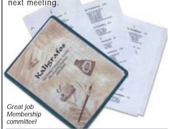
Great job Membership committee!