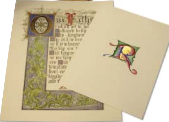
Example of engrossing and decorated letter