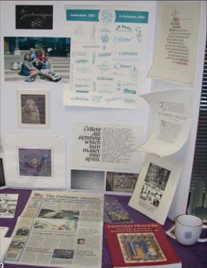
Fruits of the conference