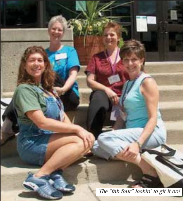
The "fab four" lookin' to git it on!