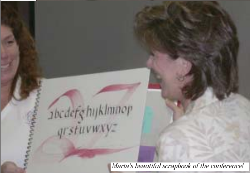
Marta's beautiful scrapbook of the conference!