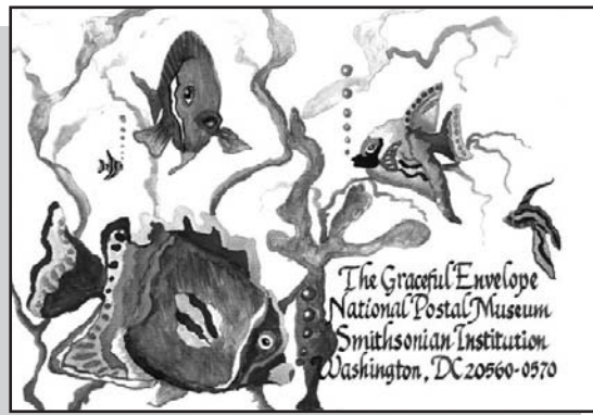
Joan's two exemplary envelop entries