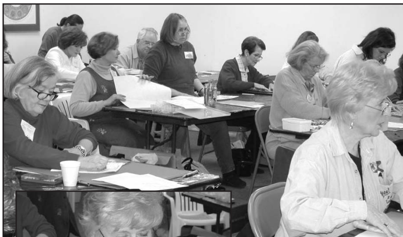
The room was packed with enthusiastic workers