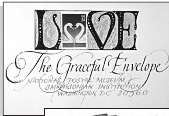
Donna's graceful and colorful envelopes

You can see more examples of The Graceful Envelope on line at www.si.edu/postal/exhibits/graceful99/gracestart99.html