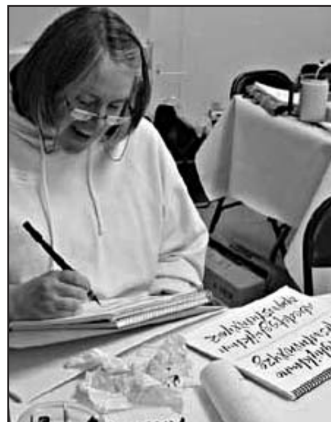
"Oh wow, I get it!!"