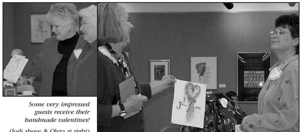
Some very impressed guests receive their handmade valentines!