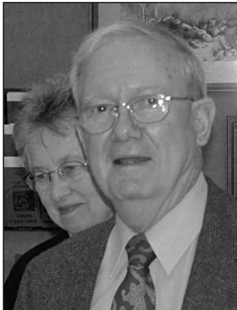
The birthday boy makes his grand entrance, and he was surprised!