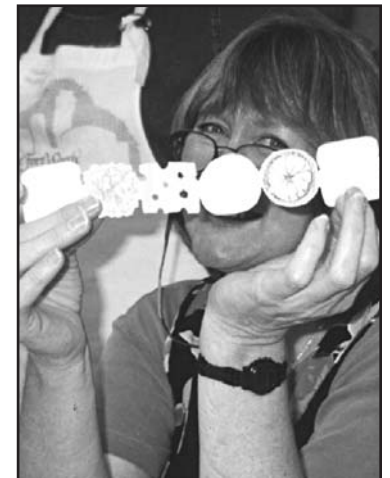
Ain't it cute?!