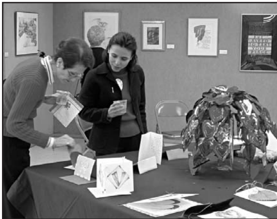
The valentine table displayed art that was given from the heart.