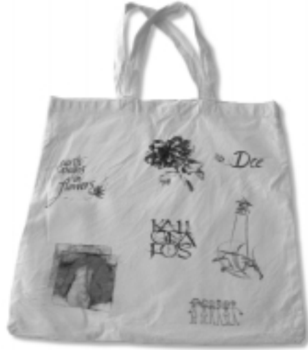
A little fabric ink and 'voila' a personalized tote!